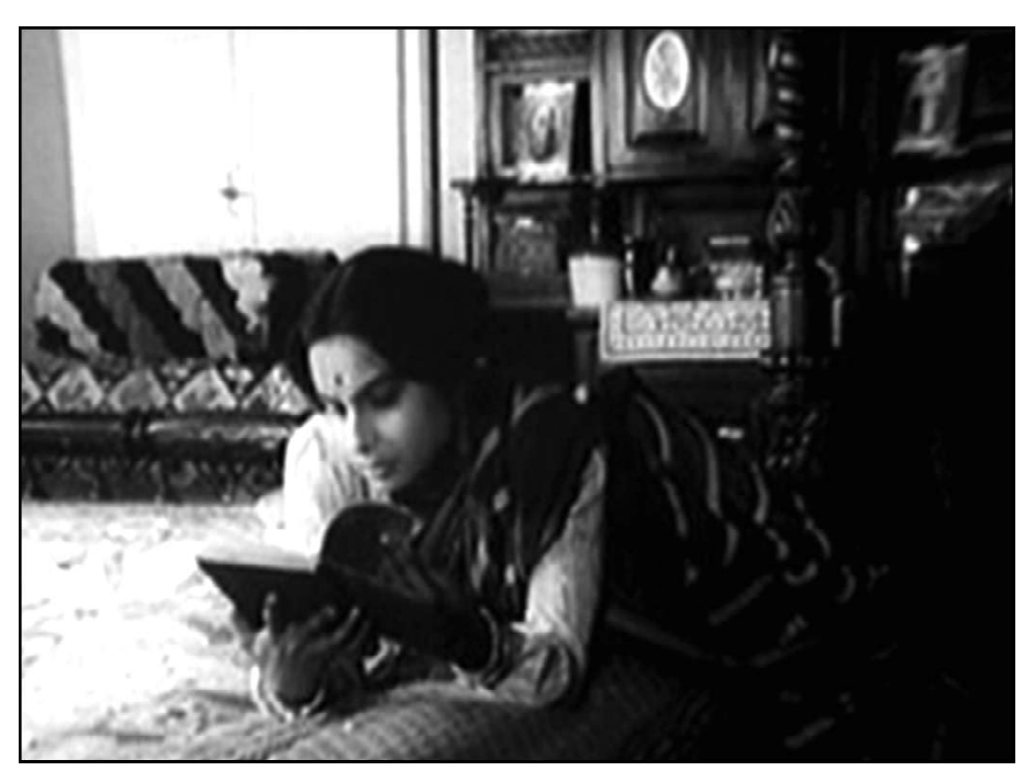
Fig. 2.2 Charulata busy reading a book in Charulata

Charulata in Nashtoneer or "The Broken Nest" is also one of the finest examples of a new woman in Tagore's stories.