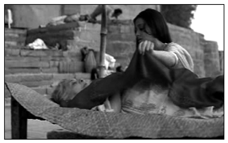
Fig. 4.3 The red-shawl episode in "Chokher Bali"