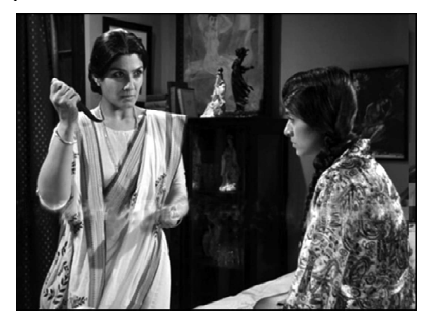
Fig. 2.1 A scene from the film Laboratory by Raja Sen

But during the turn of the new century, certain changes started taking place within the family itself. Tagore during his forties was at a height of his creative powers. Quick to sense the restlessness of the early 20th century Bengal, he created a series of short stories and novels including Chokher Bali, Ghare Baire and Nashtoneer. While young Rabindranath, inspired with romanticism, looked at women as sources of imagination, by the time he wrote his novella Nashtoneer (1903), he had learned to situate women in their real worlds, to see them as rational and desiring subjects who were constrained by social rules and norms. Nashtoneer was an attempt on Tagore's part to give voice to women's subjectivity and was quite successful in that matter and the theme was developed in many subsequent writings between 1903 and 1940. In Tagore's reputed novel Gora (1910), Sucharita and Lalita, the two main female figures, held their individual opinions on marriage. In Ghare Baire (1916), Rabindranath advanced a new picture. Nikhil, the male protagonist, wanted his wife Bimala to take her own decision regarding their relationship. He gave her personal freedom so that she might judge the worth of their relationship and then love him if she so desired. Yogayoga (Links and Gaps, 1930) depicts a conjugal relationship based on compulsion rather than choice. Tagore's message here is that Madhusudan's - or any man's for that matter - idea that women were mere submisssive beings is not acceptable.