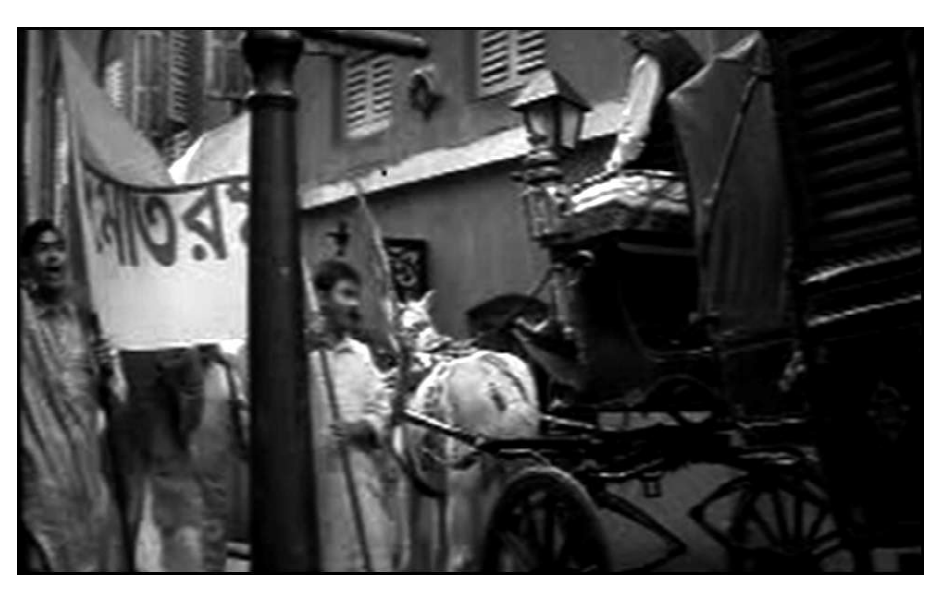
Fig. 5.1 The protestors in a rally in "Chokher Bali"

"Chokher Bali" shows the connection between woman and nation wonderfully. The story takes place between 1902 and 1905, during which there was an outburst of nationalist activities. Ghosh delineates the aura of nationalism through various ways such the slogans of the people protesting against the British rule, Behari's nationalism, references to meetings held by nationalist leaders and so on.