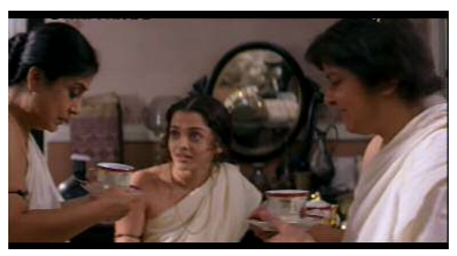
Fig. (i) The tea-making episode. A scene from "Chokher Bali showing Binodini in conversation with Rajlakshmi and Annapurna

Coming back to Rituporno Ghosh and his adaptation of the novel, the film "Chokher Bali" has presented a critique of a Hindu Bengali family that questions human society and its standardized beliefs. In this screenplay he has interwoven the cardinal human desires along with the rising nationalist zeal. He has visited 20<sup>th</sup> century Bengal and the picture that we are presented is from a 21<sup>st</sup> century viewpoint. Ghosh's Binodini stands as a recreation of Tagore's protagonist but in a new light. Ghosh has added some episodes to the original text that brings out the aspect of modernity more profoundly. There is a scene where Binidini orders to cut down some trees which initiate an argument between her and Behari. According to Behari cutting down trees is unethical to which Binodini replies that the tea he was drinking is also made of leaves that had once life in it. The way she defends her acts is quite in keeping with her education and provides justification of her modern approach towards life. Her abilities of a being a better 'housewife' than Ashalata is also clearly evident in the film. Mahendra's books in the library get eaten up by insects and termites and Binodini quickly provides a solution to it by surrounding the books with naphthalene. The red-jacket and tea-making episodes also speak of Binodini's ability to mould her to the changing times