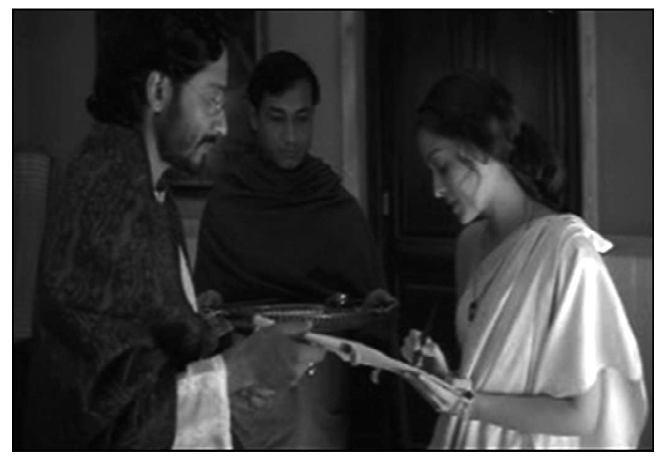
Fig: 6.1 A still from "Chokher Bali"