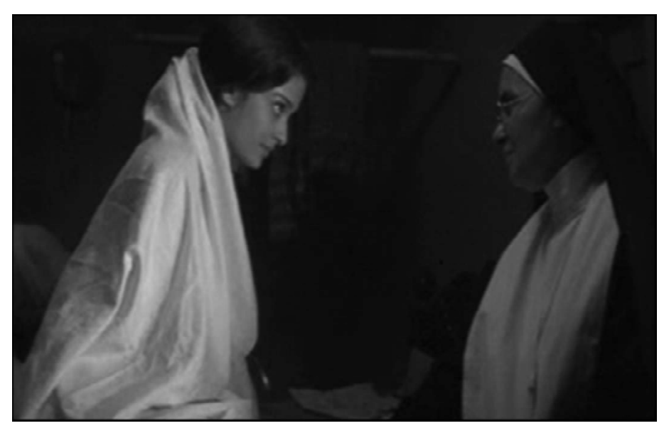
Fig. 5.2 Binodini with her teacher in "Chokher Bali"

Critics opine that the action of Chokher Bali occurs during the period when it was still a tradition to hire Englishwomen to tutor female pupils.