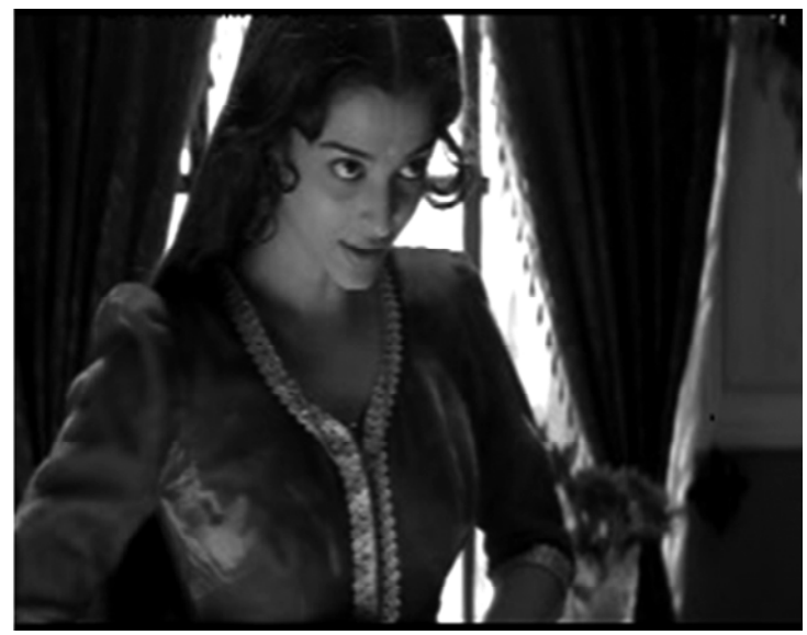
Fig. (ii) The red-jacket episode in "Chokher Bali"

In the red-jacket episode, Binodini teaches the naïve Ashalata to wear the red-jacket (blouse) which Mahendra has gifted her for their first anniversary.